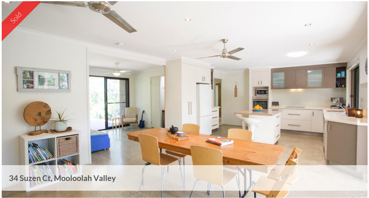
34 Suzen Ct, Mooloolah Valley