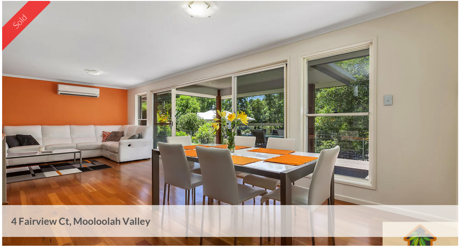
4 Fairview Ct, Mooloolah Valley