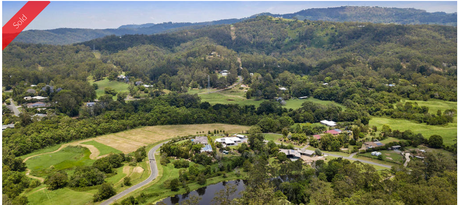
Lot 32 Rainforest Place, Diamond Valley