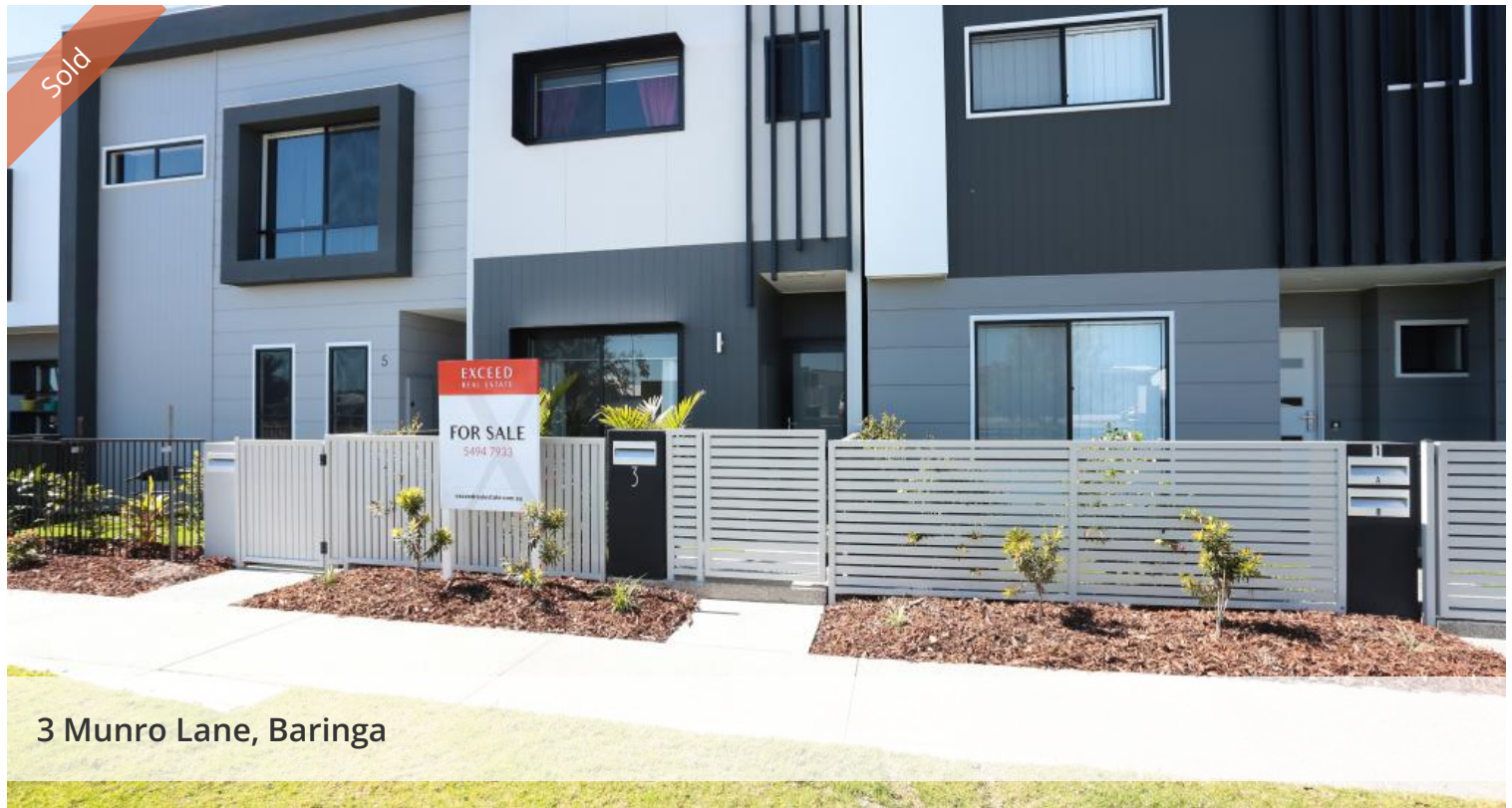
3 Munro Lane, Baringa